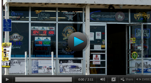
In San Mateo County the survey found that the majority of stores carry liquor, e-cigarettes and cigarillos for less than the price of a candy bar – but not fruits and vegetables. (Published Friday, March 24, 2017)